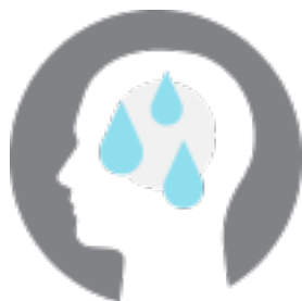
Fatigue & lethargy

Everyone experiences trouble sleeping from time to time but problems may occur when regular disturbances happen frequently and these can begin to affect your daily life.