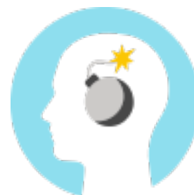
Inability to cope with stress