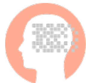
Concentration and memory problems