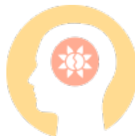
Reduced creativity and problem-solving skills