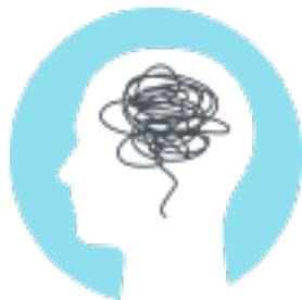
Difficulty making decisions