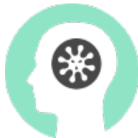
Frequent colds and infections