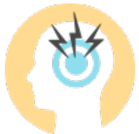
Increased risk of diabetes, heart disease, & other health problems