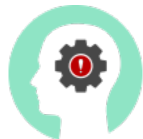
Impaired motor skills & increased risk of accidents