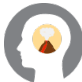
Moodiness and irritability