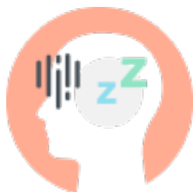
Lack of motivation